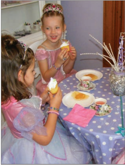
Royal Tea Party